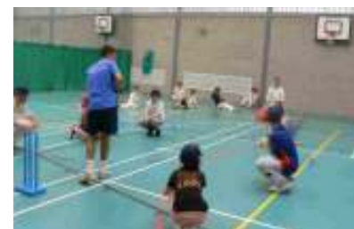
Coaching at Langford