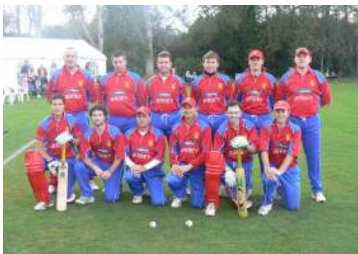
Jersey's Twenty/20 team in Guernsey

Jersey will now host two tournaments next summer, the World Cricket League Division V in June and the U15 Division I Championship in late July or early August.