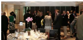
◀ The day begins with tea and coffee in the Thomas Lord Suite