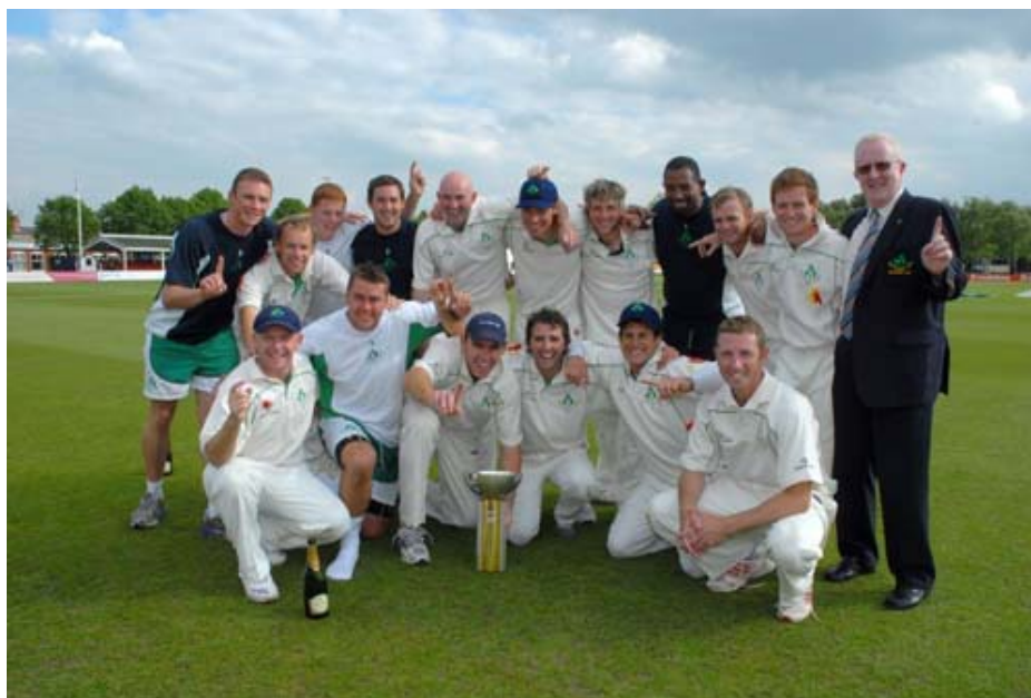
▲ Ireland, winners of the Intercontinental Cup 2006

Full match reports can be found on www.ecc-cricket.com .