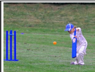
▶ A girl playing in the mixed U11 festival in Denmark