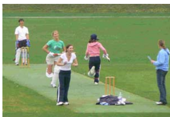
◀ Jersey ladies practice