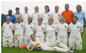
◀ The Netherlands U21 Squad