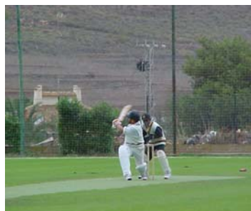
◀ Action from the Twenty20 tournament