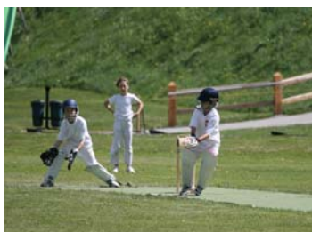
◀ Girls play in Zuoz, Switzerland