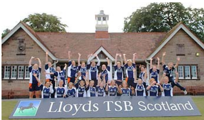
◀ Women's Academy at Fettes College