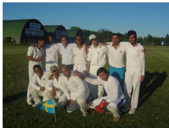
▲ Junior Challenge Winners

All matches were single-innings, 20 over games, played at Hallunda Cricket Ground in Botkyrka, with umpires appointed by the Swedish Cricket Federation from the national umpiring pool. Sigtuna Lions had a straight run of victories in all their matches culminating in an unreachable 200/8 in the final against the Afghan Tigers who could only manage a brave 169/4 in their 20 overs.