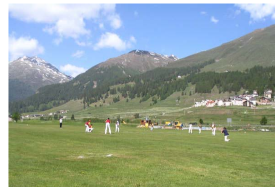
▲ Action at Zuoz