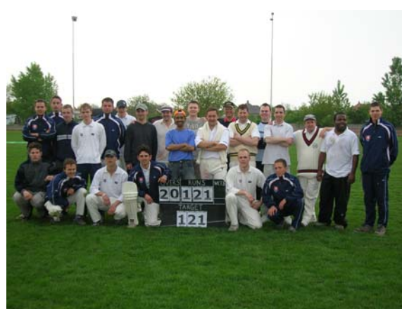
▲ Participants at the Cricket Day

The opinion of those involved and those present every year is that the quality of Slovak cricket is rising and all are looking forward to the following cricket season when the first Slovak cricket champion may be crowned.