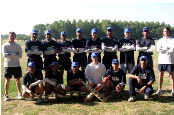
▲ Equipe de France

The French team had no excuses as 49 runs passed before they could manage their first wicket. The run chase continued in fine fashion as the top five batsmen for Grand West all made double figures but the French total seemed a daunting task for Grand West as they opted for survival tactics allowing them to pick away at the bowling for 48.1 overs before they were bowled out for 199. France won the match by 103 runs. Player of the Match: Waseem Bhatti