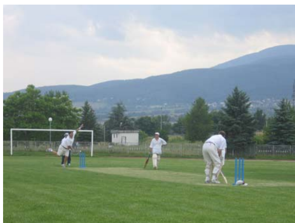
▲ Action from the Roger Short Memorial match