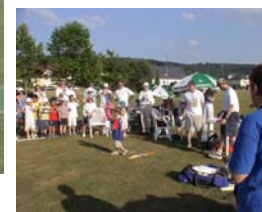
▲ Scenes from the summer camp