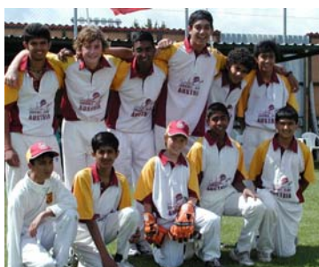
◀ ACC U15 Team

From the evidence of the match which was one of the Academy's culminating events, the coaches had been pretty successful. Two mixed teams, bringing together girls from all three countries, were going through their paces, producing highly competitive cricket with lots of tactical awareness.