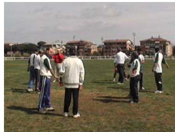
◀ GITC coaches discuss the throwing technique