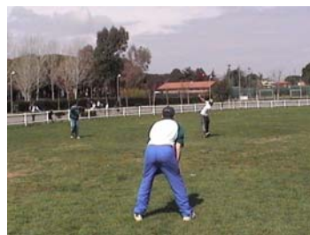
◀ Practicing throwing