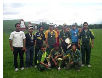
2005 League Champions Jinnah CC