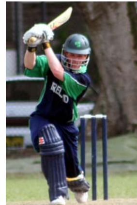
U19 CWC Irish Captain Eoin Morgan in action v England