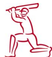
cricket without boundaries