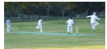
Action from the Cyprus Six-a-Side Tournament