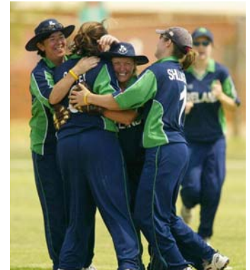
Irish Women's Squad celebrate

Switzerland – The Swiss Young Ladies Cricket Initiative, providing girls with access to equipment and facilities with the aim of establishing three teams, in Zu-