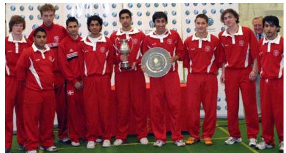
Below: Winning Danish squad with the Trophy and Salver