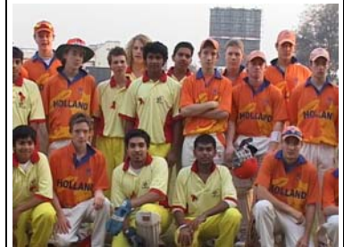
Belgium & Holland Squads