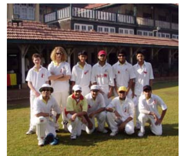
Belgian Team v Bombay Gymkhana