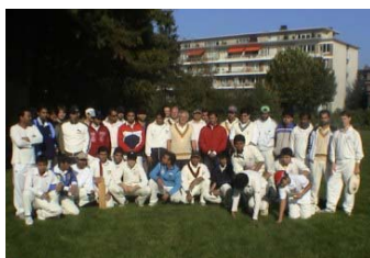
Assembled players at the Belgian Sixes