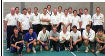
Jersey Course Attendees