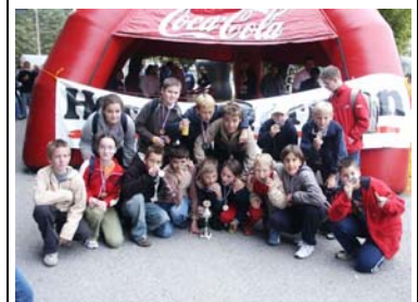
The winning School, Nova Fuzina, with their medallions and Trophy