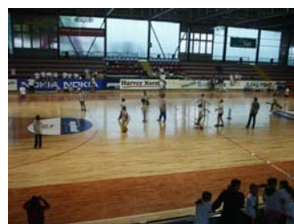
Below: action from the tournament