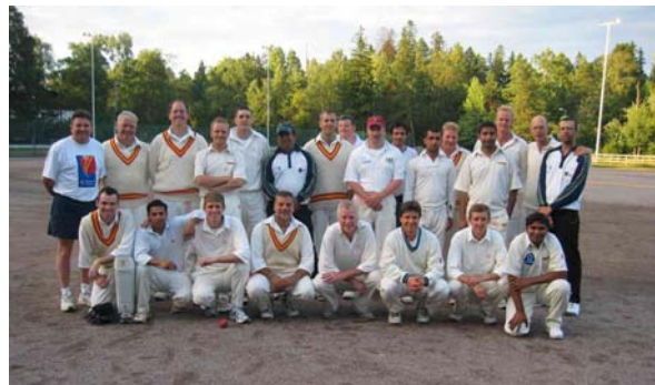
Below: FCA President's XI & MCC