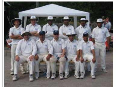
Finnish National Team v MCC