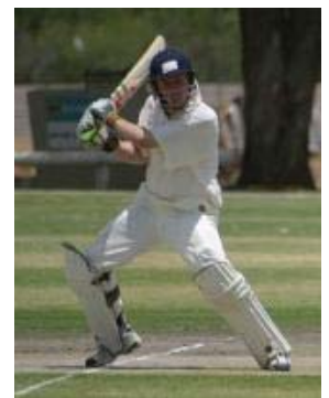
Above: Eoin Morgan on his way to 60