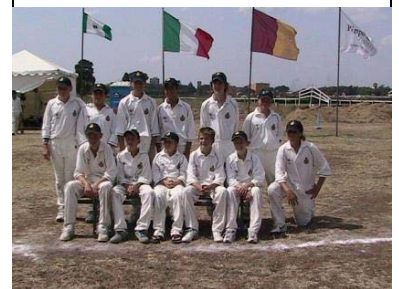
Spanish U15 team at the ECC U15 2 nd Division Championships in Rome