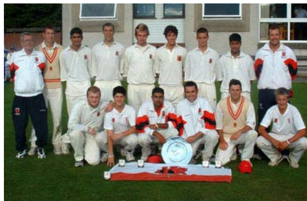
Below: Winning Gibraltar squad