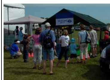
VfB Oldenburg CC's stand

To all developers in Europe we can only encourage you to present yourself on such occasions. It is worth it.