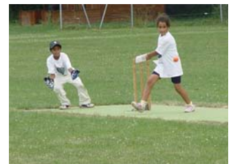
Below: Action from the matches

To keep abreast of the increase in young cricketers the Swiss Cricket Association is organising an ECC/ECB Level 1 coaching course, sponsored in part by the ICC Development Program, which has already attracted an encouraging number of participants, including parents. With at least ten more coaches willing to put time and effort into training these young enthusiasts next year augurs well for Swiss cricket.