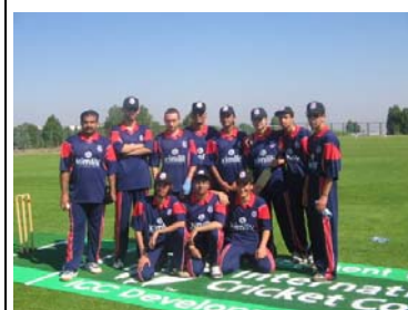
Bilkent Team with the new pitch