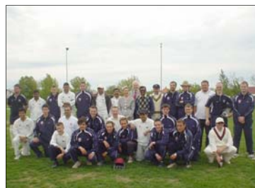
Below: Ambassadors with teams

In the afternoon, a match took place, International Team v Slovak Cricket Club. The International Team was represented by players from England, India, Scotland, South Africa and New Zealand. The whole match was held in a friendly atmosphere. And during the innings break the players could rest and enjoy a tasteful lunch. The Internationals won the match but the result was not so important. After a raffle drawn by the Ambassadors, play continued with India v England which the Indians won.