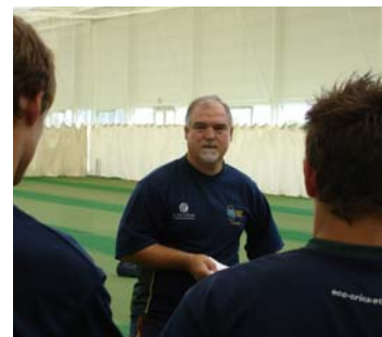
Mike Gatting demonstrates

That night we had a player's forum where we were asked to provide our views on the week currently passed. So far it has been a great experience and we are all enjoying ever moment of it. My highlight has definitely been the opportunity I was given to face Simon Jones and I am looking forward to our games commencing over the next couple of days.