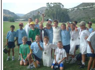
Cyprus U13 W.Cup League