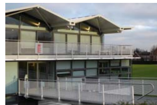
Below: National Academy