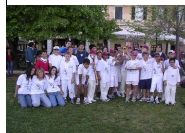
Cyprus and Corfu squads