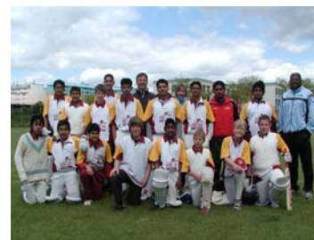
ACC U15 Team