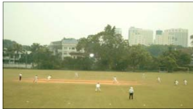
Play at Kelab Aman

See the ECC Website for the full article.