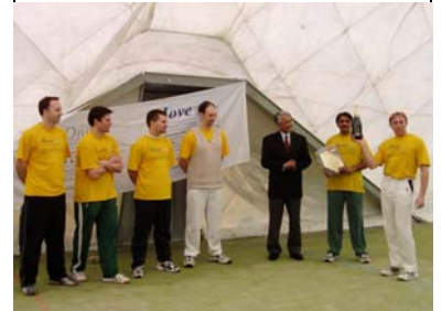
The Indian Ambassador presents the winner's shield