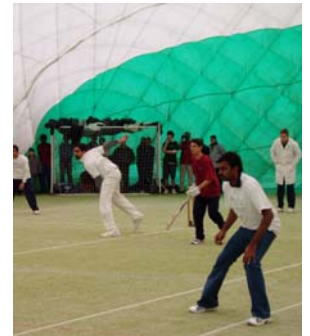
Action from the league