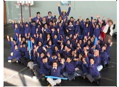
Introductory Session at Poste School