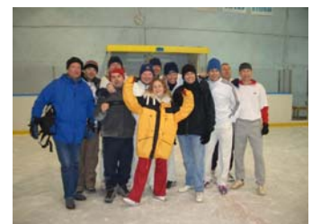
Champions Kelletino Warriors