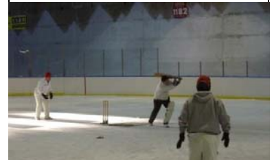
Ice cricket in action