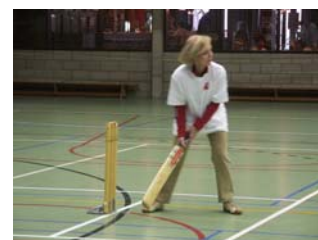
Leah Thijs, leading actress from the 'Thuis' series