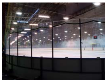
The ice pitch

Due to demand, a second tournament is being held in March.