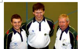
Umpires with Aids awareness ribbons