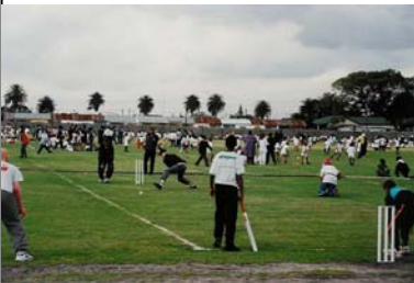
Cricket in the Langa township