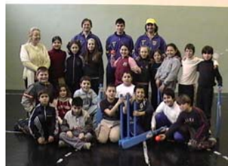
Cricket session with Taranto Coaches

build a sustainable structure so that cricket can be enjoyed for generations to come.