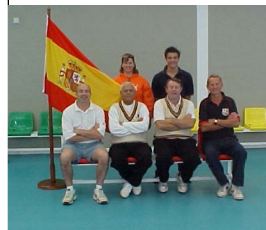
Spain's new coaches