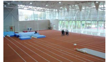
Right: Athletics Hall