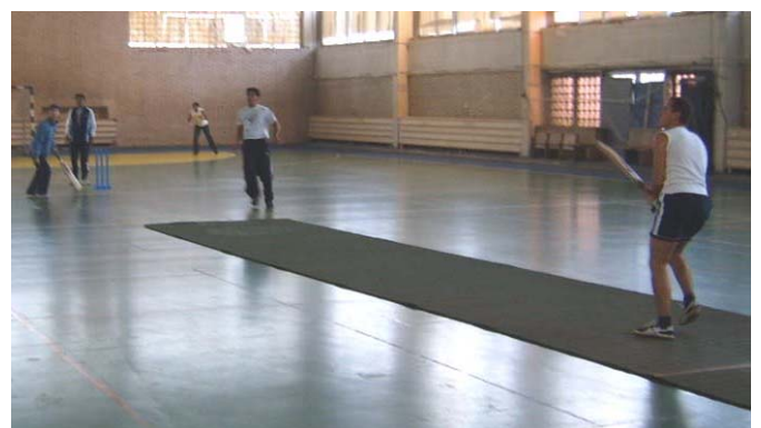
Below: Action from the tournament