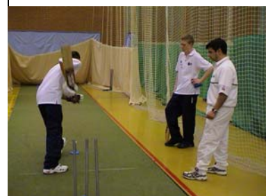
The nets at Bradfield 2004

course. The first course went down extremely well and all participants will now take cricket to their respective schools throughout the area.