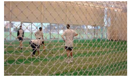
Right: Indoor nets