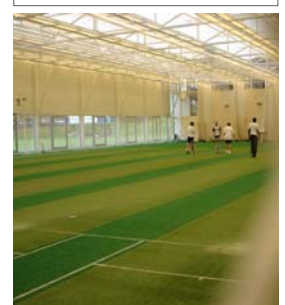
ECB National Academy