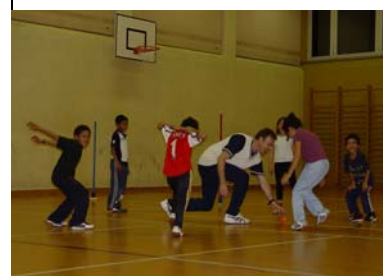
Warming up at the Kwik cricket session