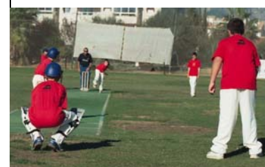
Players at the Christmas Cricket Match