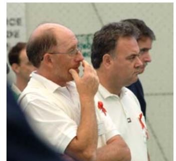
Delegates wearing UNAids red ribbons

World Aids Day is commemorated around the world on 1 st December. It celebrates progress made in the battle against the epidemic and brings into focus remaining challenges. The red ribbons are a sign of solidarity with the millions of people around the world living with HIV/AIDS.