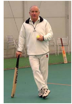
Clive Radley (Middlesex & England)