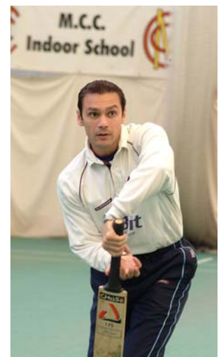
Mark Ramprakash (Middlesex, Surrey & England)