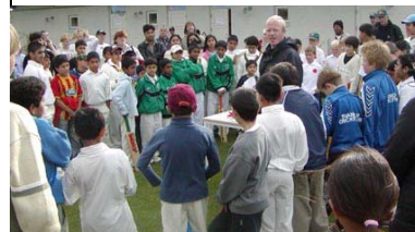
Medal presentation at Svanholm CC

The modifications to the game for the youngsters has lead to fewer players dropping out of the sport than in the past.