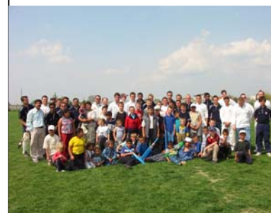
The Ambassador with the squads

Last year the club believed that the popularity of cricket in Slovakia would grow but now it is a reality.