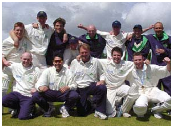
The Irish squad celebrate their win against Surrey

30th May, but sadly their bowling was not quite up to the mark with a damp ball and Northants won by 6 wickets. This run will have given Ireland confidence going into this season's ICC tournaments ahead of the ICC Trophy World Cup Qualifier in Ireland next July.