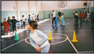
Circuit training at a school in Taranto, Puglia