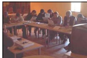
Intense concentration from the Irish coaches

A busy weekend for both Finnish and Irish Cricket but no doubt a marker for both countries as they strive for higher levels of performance at the western and northern tips of the European Development Program.