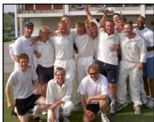
Ireland—winners of the 2003 ICC European U19 World Cup Qualifier

Ireland and Scotland's best young players are heading for Bangladesh to take on players from the 10 ICC Full Member countries plus fellow qualifiers Canada, Nepal, Papua New