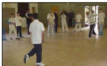
Indoor cricket comes to South-East France

A brief session of stretching and it was into the first game of indoor cricket which, of course, none of them had ever seen before, let alone played. Keep it simple, keep it straight, bowling and batting. Keep on your toes, keep concentrating, keep thinking 'this is for me', and get it back in quick, over the stumps. There's nothing like indoor cricket to ingrain good basic technique.