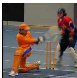
Spain take on the Netherlands at the 2003 Indoor Championships

Teams from 9 countries (ICC Associates Denmark, France, Germany and hosts the Netherlands, plus Affiliates Belgium, Hellas, Portugal, Spain and Swit-